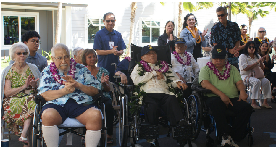
The first residents at the DKA SVH watched the ceremony.